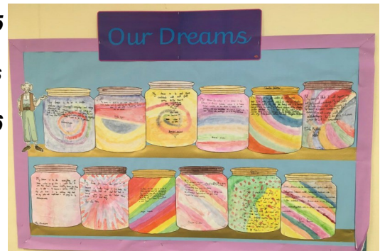
Year 6 BFG Dream Jars