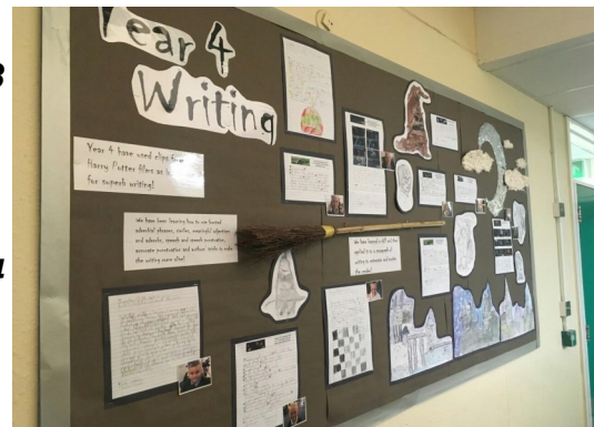
Year 4 Harry Potter Writing