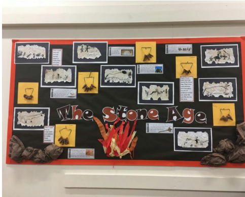
Year 3 Stone Age Artwork

As we head towards the end of term it is lovely to see the school looking bright and colourful with lovely displays of the children's learning from the first 6 weeks of the academic year. Here are just a few that have been produced by our KS2 children... KS1 to follow next week.